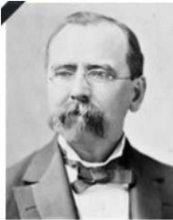
William Russell Grace