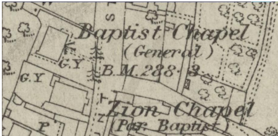
Graveyards associated with both the Unitarian chapel [marked Baptist Chapel (General)] and the Zion Chapel (Par. Baptist) marked GY on this extract from sheet LVII.4 of the 1873-4 OS 1:2500 map

two graveyards were clearly marked GY on the 1:2500 OS map of 1873-79 which should have raised suspicions on the local Planning Committee in the late 1970s.